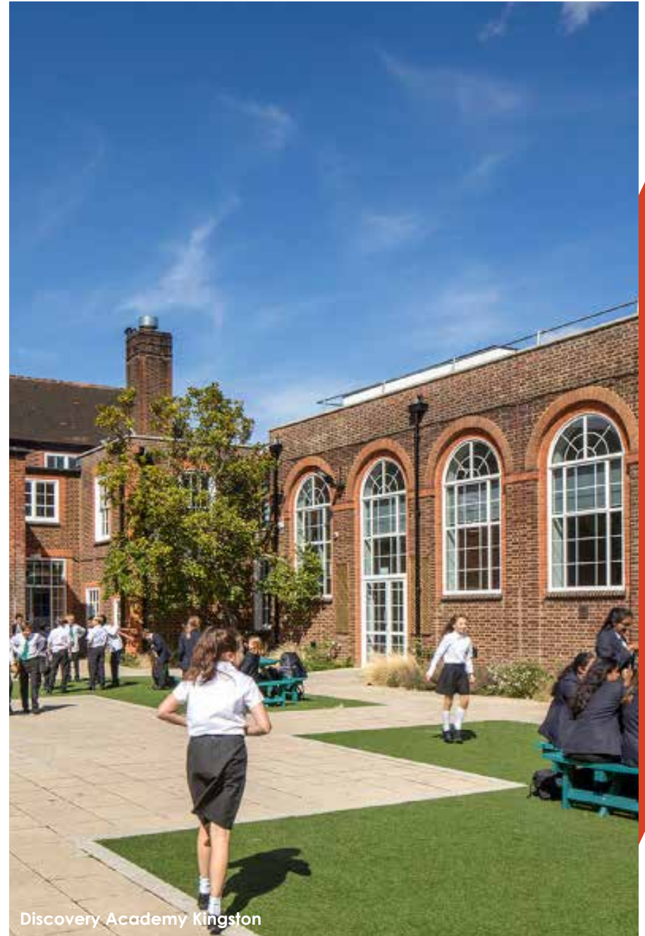
Discovery Academy Kingston