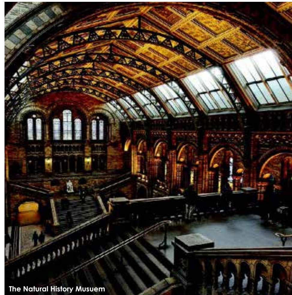
The Natural History Musuem