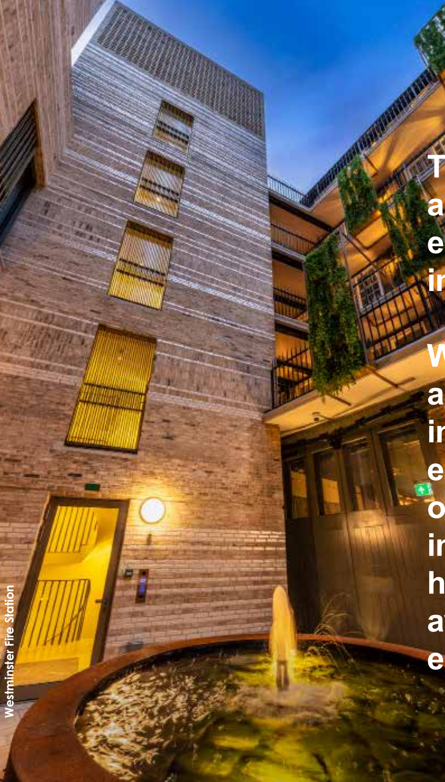
Westminster Fire Station

Tilbury Douglas is a leading UK building, engineering, fit out and infrastructure company.