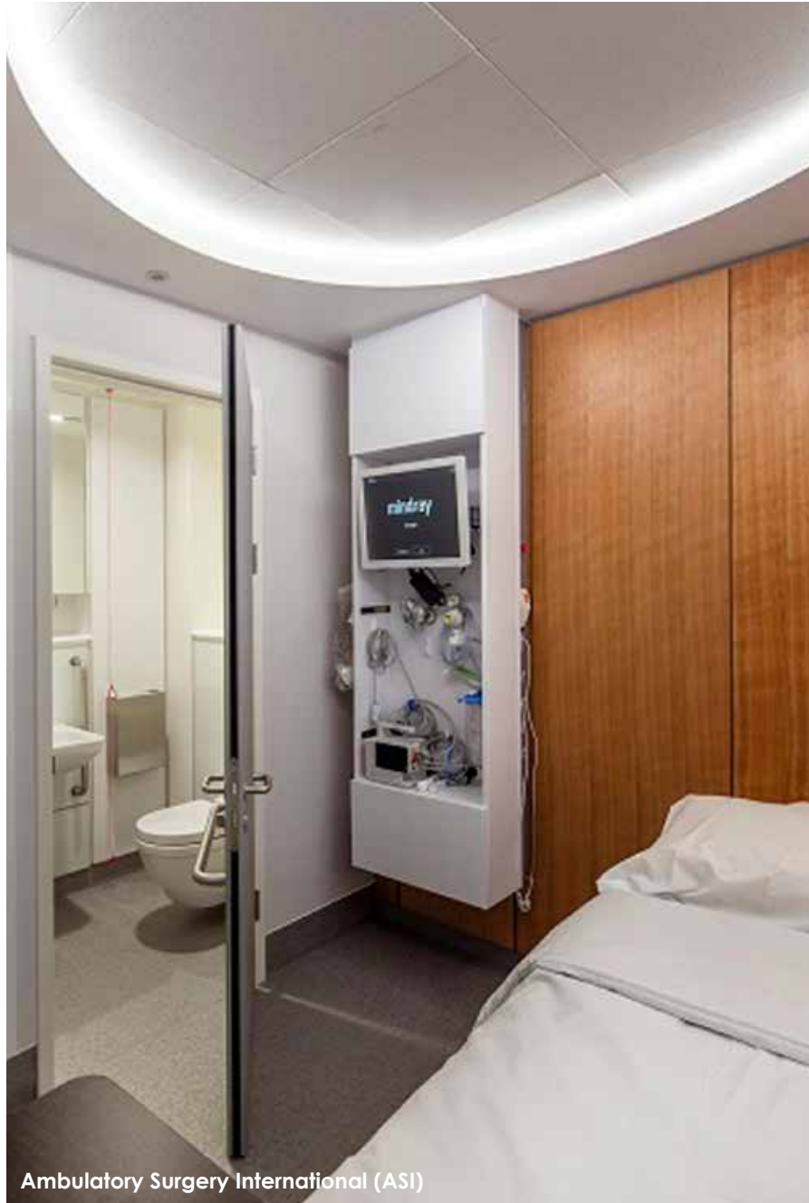
Ambulatory Surgery International (ASI)