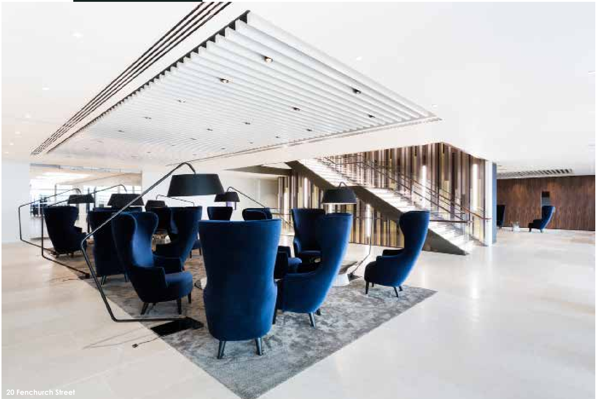
20 Fenchurch Street