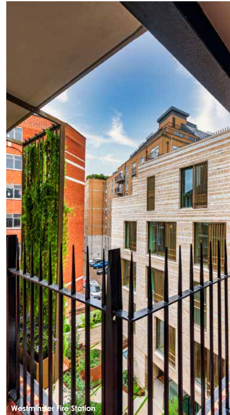
Westminster Fire Station

From repeat customers, to working across local, regional and national frameworks, we execute a high level of quality with a personable touch throughout the health, education, commercial office, justice, defence, industrial, leisure and hospitality, highways, aviation, water, and environmental sectors.